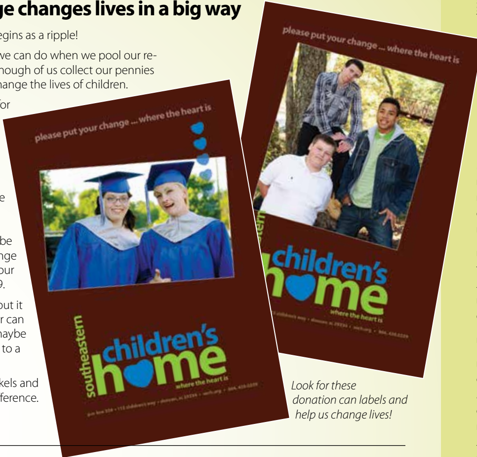
Look for these donation can labels and help us change lives!

Those pennies, nickels and dimes can make a difference. We need your help!