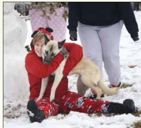
Cold hands, warm hearts on a snowy Duncan day.

It's recently come to our attention that Skyla may be a Belgian Malinois.