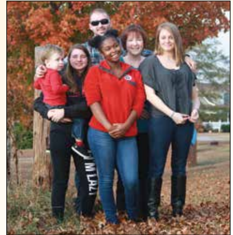
We honor our houseparents at Southeastern Children's Home every day of the year.

Don't wait. Tell your parents "thank you."