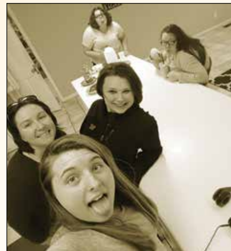
Thanks to your generosity, we're keeping smiles on faces at Southeastern Children's Home.

naming Southeastern Children's Home as the designated recipient. Gift matching programs are a great way to multiply your gift to a great charity!