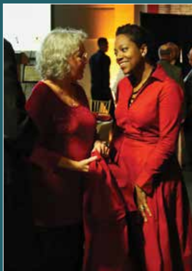
Fellowship and remembrance during the 50th anniversary gala.

Each of us felt a part of something special