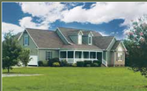
This home purchased by Southeastern in 2018 is being upfitted for residency.

We're ever mindful that Southeastern's ministry would not exist for thousands of broken children were it not for the multitude of people, particularly our donors and prayer warriors, who come forward to bless this ministry every day. Which is exactly why we gathered that wet and wonderful winter evening – to celebrate and give thanks for the fifty years that God has blessed our home.