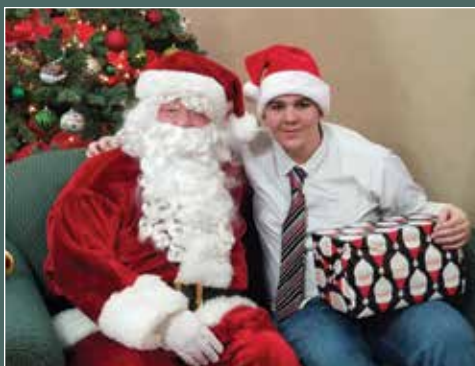
Special delivery to Southeastern from Santa